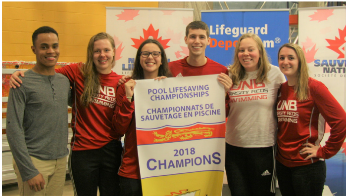
2018 Pool Lifesaving Club Champions the University of New Brunswick