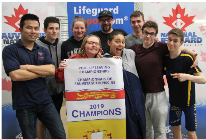
New Brunswick Champions, Canada Games Aquatic Centre, pose with banner at the 2019 New Brunswick Pool Lifesaving Championships.

Please join us August 12, 2019 at Parlee Beach for the 33 rd New Brunswick Waterfront Lifesaving Championships. Registration packages are available on the Society's website www.lifesavingnb.ca